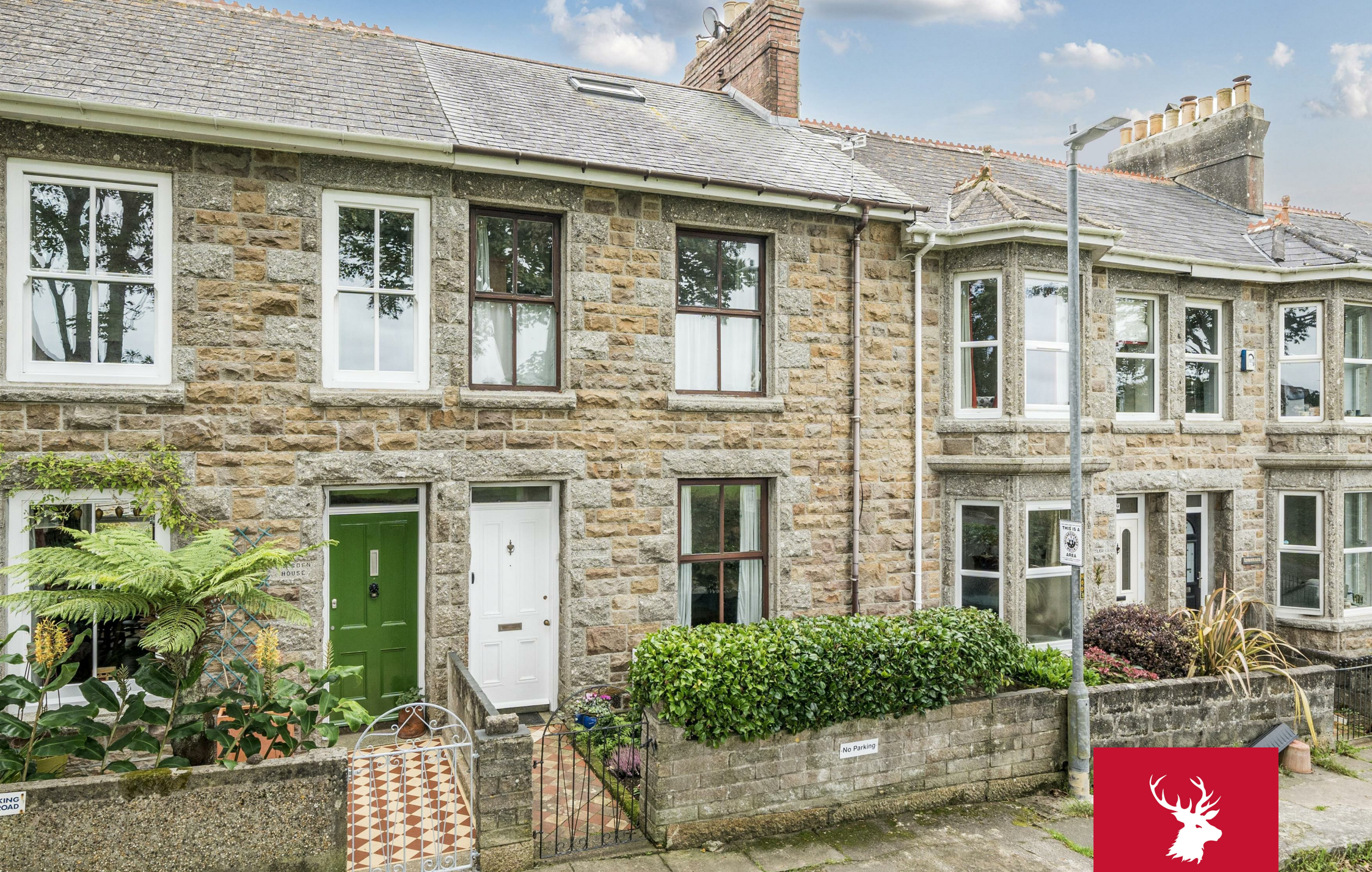
8 Rosevean Terrace